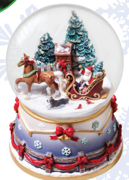
700232 Holiday Homecoming Musical Snow Globe