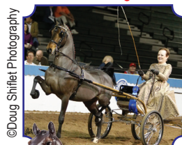
Heartland High Tech