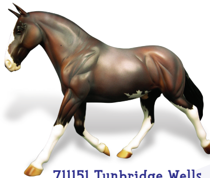
711151 Tunbridge Wells Qty of 1200 • $65

Each BreyerFest Special Run model has "BreyerFest 2012" imprinted on its belly to ensure authenticity.