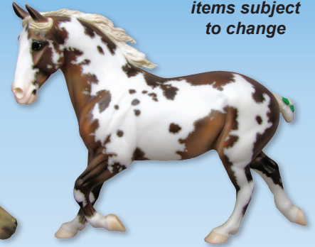
Chestnut Pinto Draft Mare