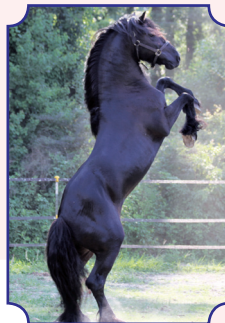
Baroque Farm Dales Ponies

Native to England, the Dales Pony was bred to be a pack pony, carrying heavy loads while navigating rough terrain. Their strength and sure-footedness made them an asset in areas where larger horses would have trouble traveling. The Dales Pony is represented at BreyerFest by Baroque Farms.