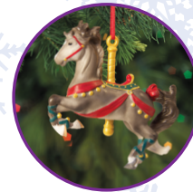
700612 Melody - Prancer Carousel Horse