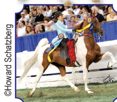
9 CH Sprinkles