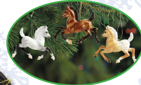
700656 Merry Fillies Ornaments