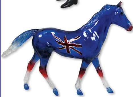
Clearware Union Jack Horse