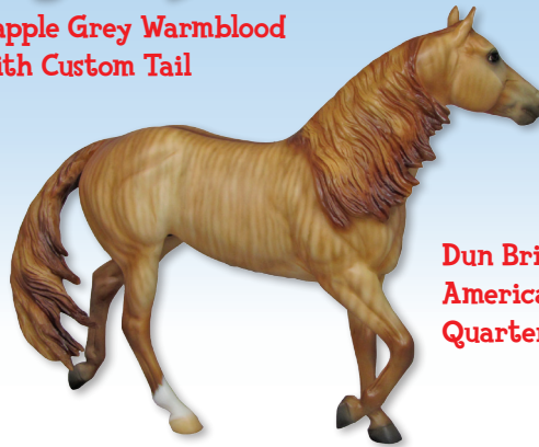
Dun Brindle American Quarter horse