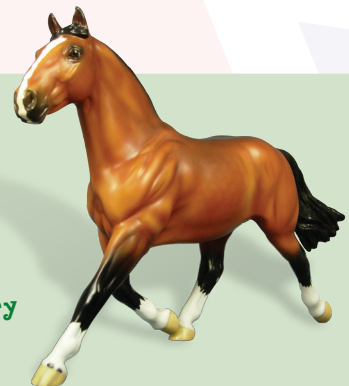
711144 Killarney Porcelain Qty of 400 • $100