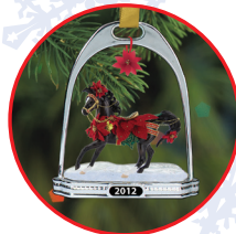
700312 Noche Buena Stirrup Ornament