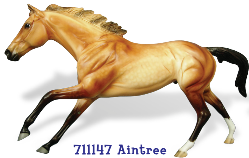
711147 Aintree Qty of 1400 • $65