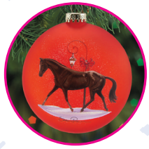
700812 Artist Signature Ornament