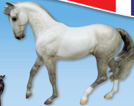
Dapple Grey Warmblood with Custom Tail

Twenty-nine exciting models will be offered. Don't miss this exciting live auction Friday, July 20 in the Hall of Champions!