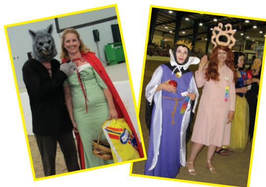
Some great costumes from BreyerFest 2011.