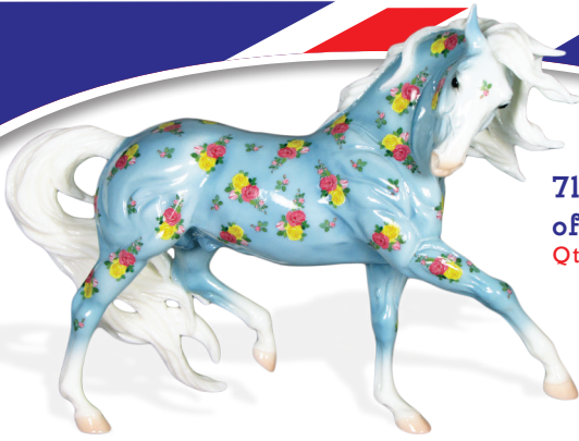
711142 Prince of Chintz Qty 1100 • $65