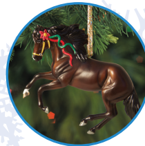
700512 Peruvian Paso - Beautiful Breeds Ornament