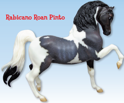
Rabicano Roan Pinto