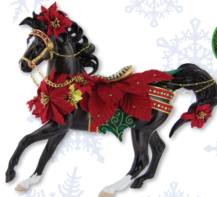
700112 Noche Buena